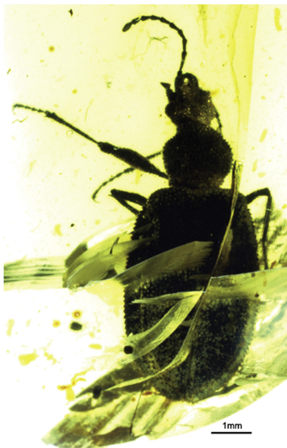
Fig. 2. Omma cf. lili Jarzembowski, Zheng and Wang, 2017a NIGP 172205; probably Noije Bum, mid-Cretaceous. Photograph of dorsal view in brownish yellow cabochon. (For interpretation of the references to colour in this figure legend, the reader is referred to the web version of this article).

(mandibles), unlike the arched jaws of other fossil and recent archaic beetles (such as the two species compared above). The elongation would have provided greater reach and the jaws are twisted apically for clasping as in recent stag beetles (Goyens et al., 2016: Fig. 1.1), but they are not grossly enlarged as in the latter for aggressive fighting. More material is needed to help determine if the jaws were a male attribute only as in the recent beetles. A slender body form with long legs has been linked with diurnal activity in O. rutherfordi (on shrubs; Lawrence, 1999), but O. davidbatteni sp. nov. has well-developed eyes unlike the smaller, beady ones in this recent species and was possibly nocturnal rather than day-active.