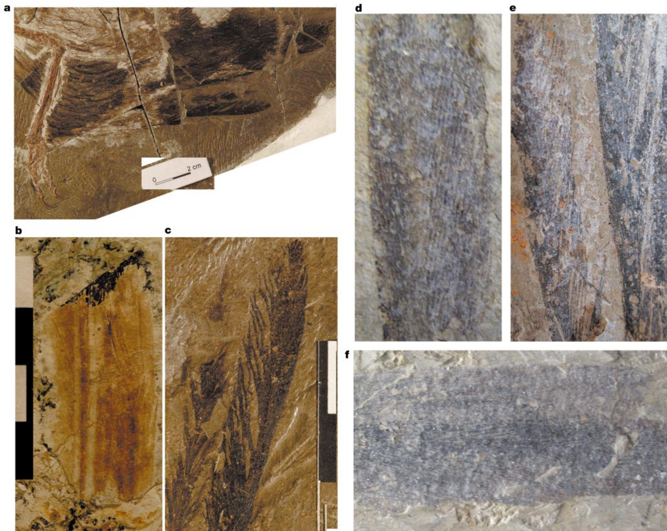
Figure 3 Feathers showing the asymmetrical vanes. Pennaceous feathers attached to the left metatarsus of IVPP V13477 (a) and right metatarsus of IVPP V13320 (b). c, Close-up of a distal pennaceous feather on the left metatarsus of IVPP V13477. d, Close-up of a