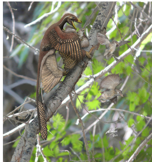
Fig. 3. Reconstruction of the life habits of M. gui .

Unlike other birds known from the Jehol, all known enantiornithines possess pedal morphologies suggesting they were adapted for arboreal environments rather than for foraging on the ground or in aquatic environments (31, 32). This understanding is supported by pedal proportions, which have been shown in modern birds to be indicative of ecology (33–34), as well as in the morphology of the foot, which is better adapted for perching than walking, with large recurved claws and a hallux that is positioned low on the tarsometatarsus. Although digit III cannot be measured in this specimen (nor can digit IV completely), the penultimate phalanx in digits II and IV are longer than the proximal phalanges, consistent with arboreal habitats