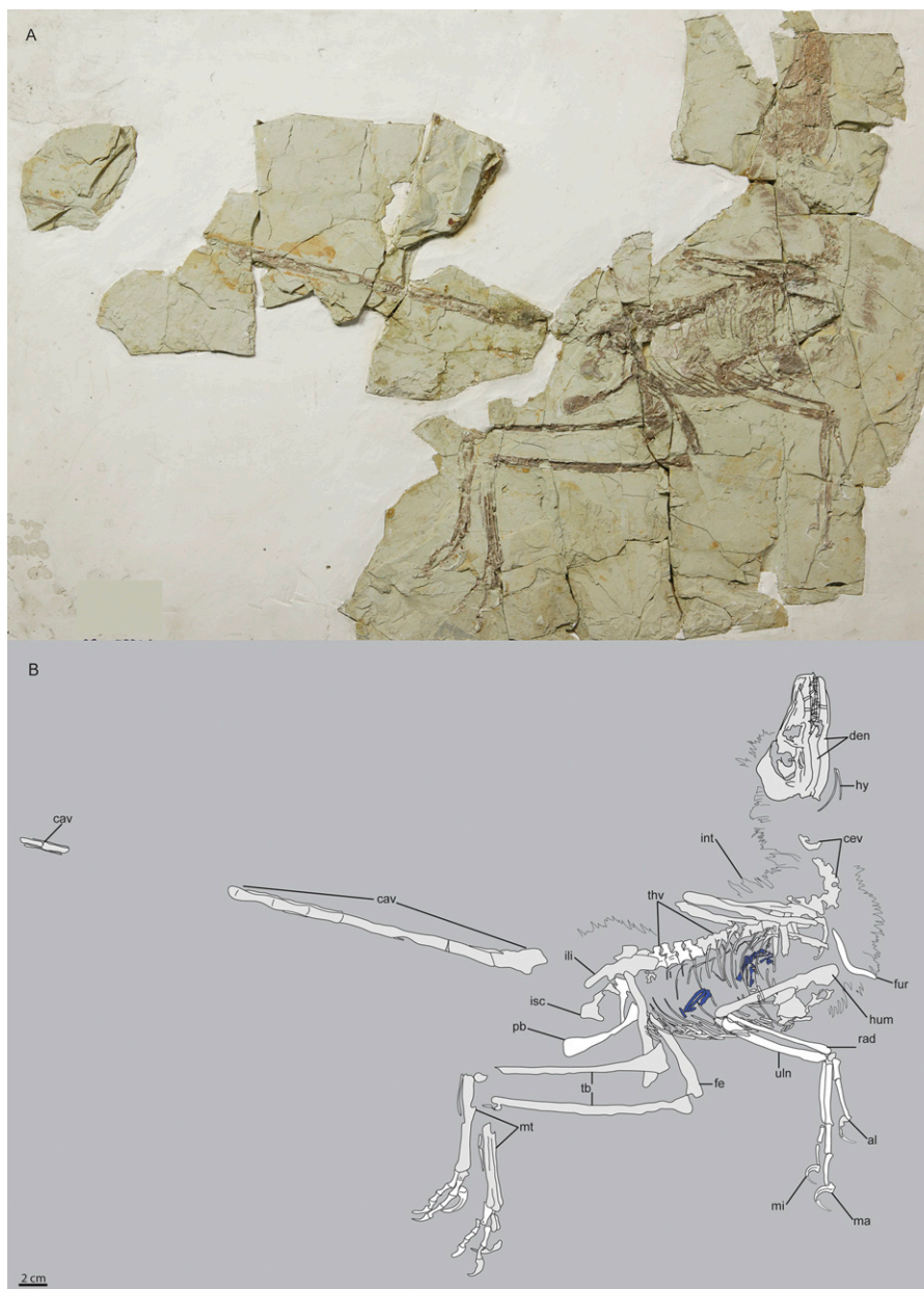
Fig. 1. Photograph (A) and line drawing (B) of IVPP V17972A. Anatomical abbreviations: ald, alular digit; cav, caudal vertebrae; cev, cervical vertebrae; den, dentary; fe, femur; fur, furcula; hum, humerus; hy, hyoid bones; ili, ilium; int, integument; isc, ischium; mad, major digit; mid, minor digit; mt, metatarsals; pb, pubis; rad, radius; tb, tibia; thv, thoracic vertebrae; ul, ulna.

which are subequal. Metatarsal IV is the thinnest, as in other enantiornithines, and all three metatarsals are located in the same plane along their entire lengths, lacking the plantar displacement of metatarsal III that characterizes the more advanced ornithurine birds. The trochlea of metatarsal II is the widest; the trochlea of metatarsal IV is reduced. The pedal phalanges are all elongate and delicate; digit II is more robust than the other digits. The claws are all large and recurved (as opposed to the short, uncurved claws present in the cursorial ornithurine birds) with deep lateral grooves. Although the individual is too incomplete to assign to a specific taxon, we tentatively assign the specimen to Cathayornithiformes, the most prevalent enantiornithine group in the Jehol, based on size and the relative trochlear position of the tarsometatarsus (16).