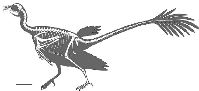
Fig. 3. Reconstruction of the plumage of Jeholornis . (Scale bar: 5 cm.)

Aerodynamic properties of the tail other than lift are less amenable to quantitative evaluation on the basis of theoretical