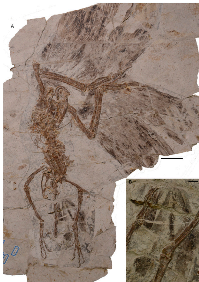
Fig. 1. Jeholornis sp. STM2-37 preserving the proximal tail fan in situ forming a horizontally oriented fan, or aerofoil. (A) Full slab. (Scale bar: 5 cm.) (B) Close up of the proximal fan. (Scale bar: 1 cm.)

comparable in rachis thickness with the remiges and proximal tail feathers (0.366–0.398 mm), their vanes are narrow and curved and taper sharply along their distal thirds. The vanes are preserved in only two specimens, and it is unclear whether they are symmetrical. In STM2-11, only the caudal half of each vane is preserved whereas, in SDM 20090109, the feathers appear symmetrical on one side of the tail and asymmetrical on the other.