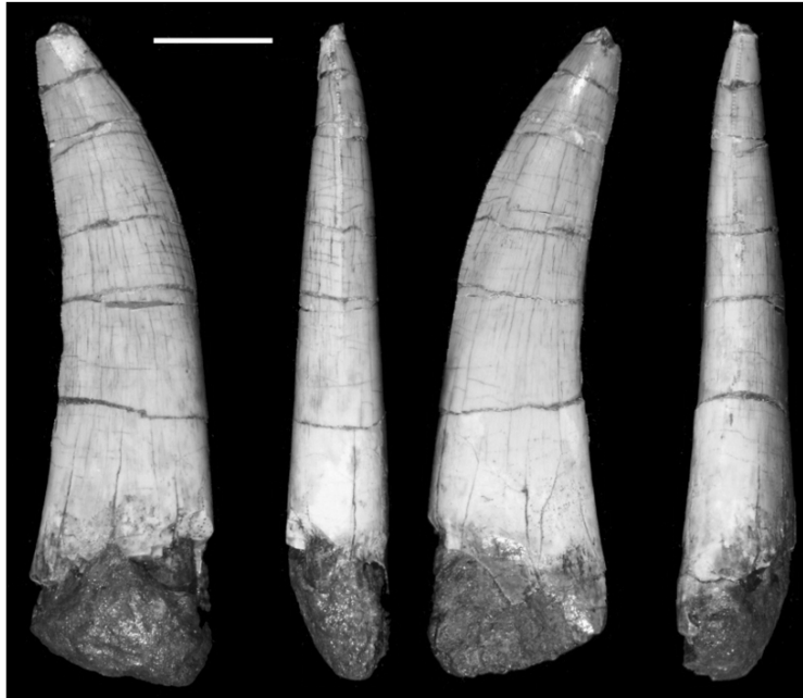
Fig. 1 Tooth XMDFEC V0010 seen in (left to right) labial, anterior, lingual and posterior views Scale bar = 10 mm

The tooth is long, tapers evenly to the tip and is very slightly D-shaped in cross-section being somewhat more flat on the lingual face and bowed on the labial face (though this is overall much closer to a circular cross-section than a more normal laterally compressed theropod tooth as is common for spinosaurids). The tooth exhibits a gentle posterior recurvature along its length. In anterior and posterior view, it shows a slight sinusoidal curve labio-lingually (see Fig. 1), a feature that does not appear to be the result of breakage or distortion.